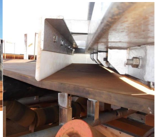
Operational conveyor diversion plough

ODGKINSON PRODUCTS H&B MINING THE EXPERTS IN CONVEYOR SKIRTS